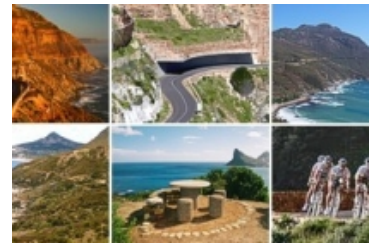
Chapmans Peak Drive

DESCRIPTION: One of the most beautiful drives in the world, Cape Town's Chapmans Peak Drive is a spectacular 10 km coastal drive linking Noordhoek to Hout Bay. In spring (Sept-November) Southern Right Whales can be spotted in Hout Bay. Year round there are stunning views from numerous viewpoints and picnic spots. A trail to Chapman's Peak itself starts just before the highest viewpoint on Chapman's Peak Drive. If the road is closed or if one only wants to access the portion of the road closer to Hout Bay, a complimentary day pass can be acquired from the toll booth.