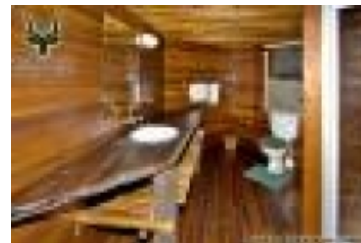
Forest Tent (FT2), Limpopo Forest

DESCRIPTION: A fantastic network of jeep track and twisting singletrack wind around the mountain within the Tokai forest plantation. There are maps and permits (R10) available at the picnic area kiosk. Routes can extend from a few kilometers on up, depending on time, skill, and fitness. Bikes can be rented from Bowmans Cycles in Cape Town.